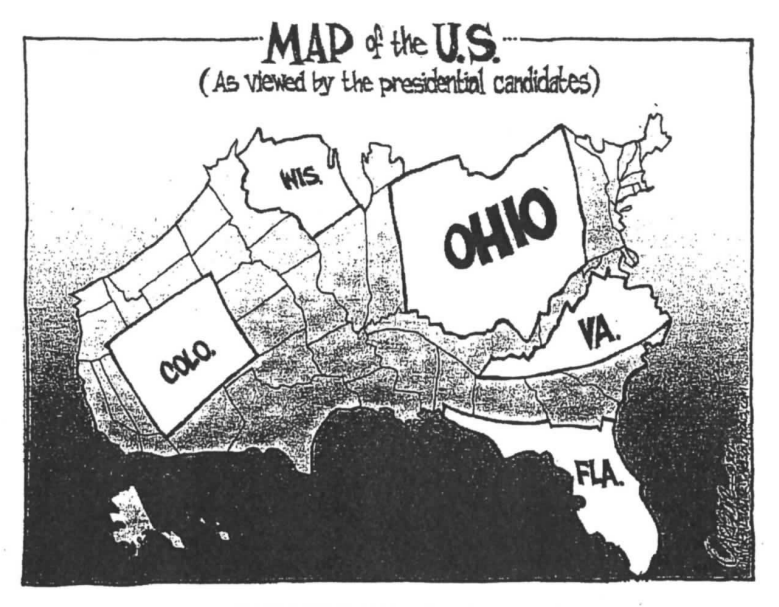
CARLSON © 2012 Milwaukee Journal Sentinel. Reprinted with permission of UNIVERSAL UCLICK. All rights reserved.